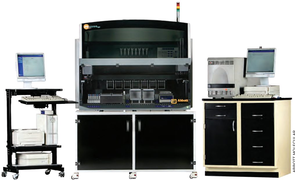
Finding the target: The Abbott m2000 system, an automated instrument for DNA and RNA testing in molecular laboratories, is being used to identify the target for GlaxoSmithKline's new lung cancer drug. The system consists of two instruments, m2000sp for the automated purification of nucleic acids, and m2000rt for amplification and detection using real-time polymerase chain technology.