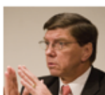
Clayton Christensen Harvard Business School

The seventh annual Personalized Medicine conference will take place November 9-10, 2011 at The Joseph B. Martin Conference Center at Harvard Medical School in Boston. This year's two-day conference will highlight the current clinical impact of personalized medicine as it enters the healthcare delivery system and how recent experience may guide and inform the policies, plans and actions of stakeholders among government, academe and the private sector. Widely considered the premier event in the field, the conference attracts over 600 national and international thought leaders.