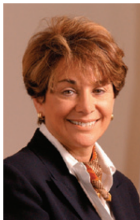
Rep. Anna Eshoo (D-Calif.) plans to introduce a new version of the GPMA later this year.

a hard sell politically in the current fiscal environment, we will carefully craft the arguments for these incentives before we bring them to Congress.