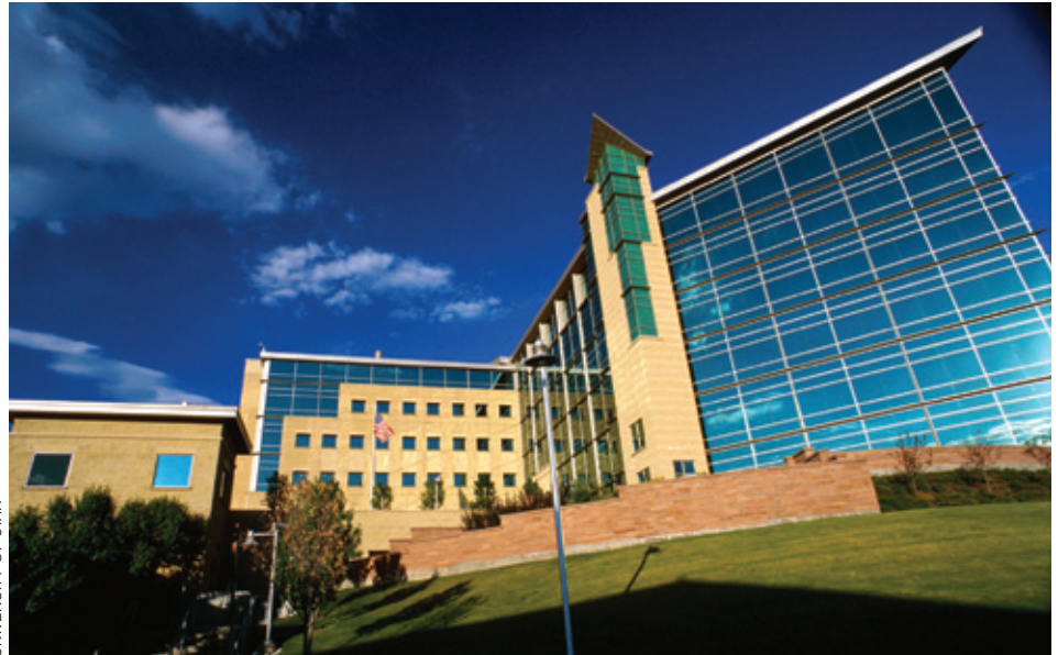
UNIVERSITY OF UTAH

Since 2008, leaders in personalized medicine from Utah and around the country have hosted the