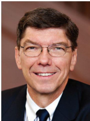
Clayton M. Christensen, DBA, has described personalized medicine as a disruptive innovation.

Personalized Health Care Summit in Deer Valley, Utah. At the 2010 forum, Utah native Clayton Christensen, DBA, Harvard University Business School Professor and author of The Innovator's Prescription , kicked off an effort to develop a "Roadmap for Personalized Health Care" to highlight the ways in which personalized medicine will upend traditional medicine.