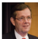
Michael Leavitt Health & Human Services